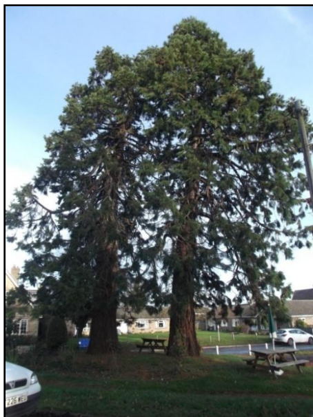
Fig.13 Sequoia trees, a Californian redwood variety to the front of the Bertie arms confers a rural character. The trees are protected by TPOs.

Trees are a significant feature within the conservation area which frame key views or form the backdrop to important buildings. Many of the trees are specimen varieties, and form part of Uffington Park or have been arranged within groups at focal points in the village which are likely to have been planted by the Bertie family and include a number of Redwoods and Wellingtonia.