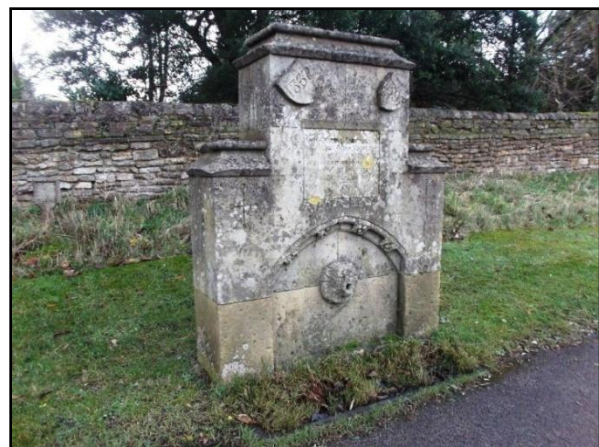
Fig.15 Fountain, Main Road, erected to celebrate Queen Victoria's Diamond Jubilee, and forms a focus to views from Casewick Lane.

formal arrival to many of the properties within the village. Examples include, Garden Lodge Cottage (Grade II) and