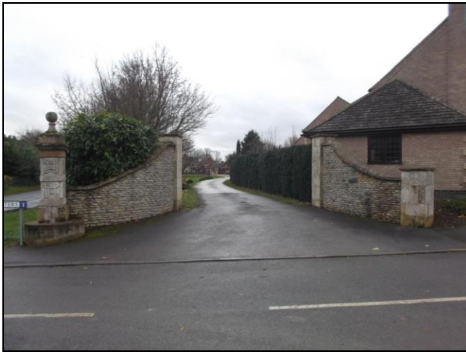
Fig. 14 Ornamental gates at the entrance to Home Farm, Greatford Road.

other more formal examples which are listed in their own right, such as those at the North and South Gate lodges (Grade II) and the demolished Uffington House (Grade II*). At the entrance to the Parish Church are some historic paved surfaces, which form part of the structured view towards the gates of the former Uffington House.