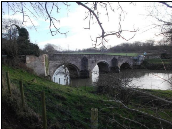
Fig.8 Grade II listed Uffington Bridge

Within Uffington Park are a number of trees that are covered by TPOs. The parkland makes a strong contribution to the character and appearance of the conservation area, in terms of its historic association with Uffington House, the historic development of the village and also its amenity and landscape value. To the south of Main Road, the parkland contributes towards a sense of spaciousness as well as forming the basis of attractive views in a south westerly direction and long ranging views towards Burghley Park and beyond. Included within the parkland is a an ice house and spring which are Grade II listed and a number of other non –designated ornamental features such as a garden archway. At the south eastern tip of the Parkland is the Grade II listed Uffington Bridge, Barnack Road which forms part of an attractive entrance to the conservation area from Barnack.