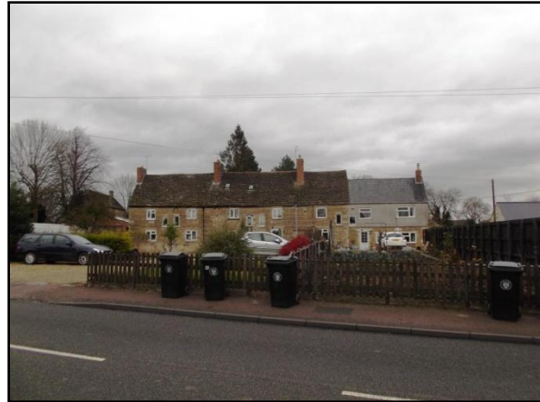
Fig.19 Nos.33 – 43 Main Road. The terrace has suffered from incremental erosion of original features such as windows and the use of render on the first storey of No.43 is not in keeping with the material palette of the conservation area.