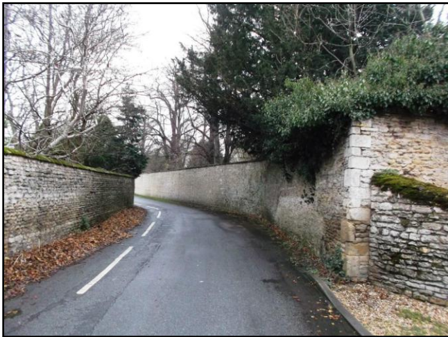
Fig.5 Greatford Road, high boundary walls creating an enclosed character.

Casewick Lane and School Lane are characterised by a low density of development. The eastern side of Casewick Lane has an attractive harmonious character and comprises four pairs of estate workers cottages, with a defined layout in the street and built to a similar design.