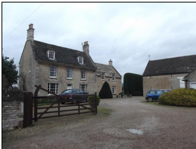
Fig. 16 West Hall Farm and outbuildings are a significant group of building within the conservation area.

List descriptions are available online via the Heritage Gateway website http://www.heritagegateway.org.uk/gateway/