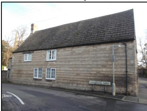
Fig.20 UPVC windows, such as at The Old Shop Cottage detract from the traditional character of the conservation area.