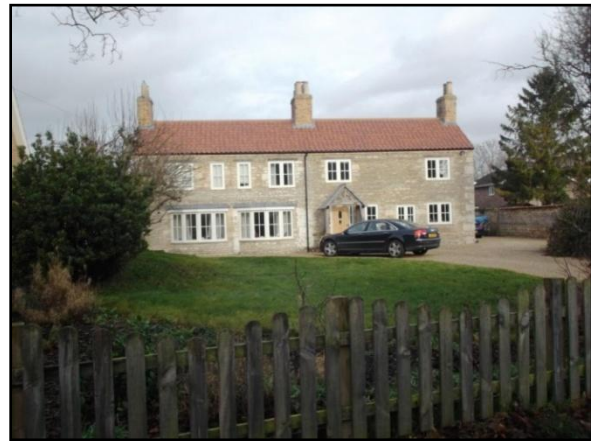
Fig.7 Nos. 36 and 37 Bertie Lane, Formerly two cottages, but now appears to be one Lane; although the property has been altered by changes to the windows it makes a positive contribution through its use of traditional design and local cream stone.

absence of footways and the presence of mature trees. The slightly curved alignment of the road and the high stone boundary walls to Home Farm and the Old Rectory constrain the views along its length. It has a low density of development and the large scale