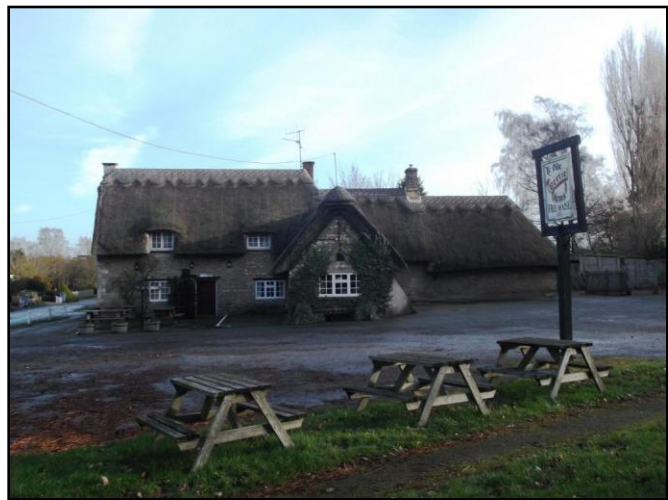
Fig.11 Thatched roofs are a common feature of some of the older properties within the village, such as the Bertie Arms, above.

The traditional buildings range in date from the 17th-19th centuries. They are primarily constructed of coursed limestone rubble masonry with stone quoins and Collyweston slate roofs. The Bertie Arms, Village Hall and No. 15 Casewick Lane have thatched roofs. The buildings are generally built in a simple vernacular style which, together with the common palette of materials creates a harmonious street scene. The loss of traditional timber windows and doors and the inappropriate replacement with UPVC to standard designs detracts from the appearance of the individual buildings and from the overall character of the