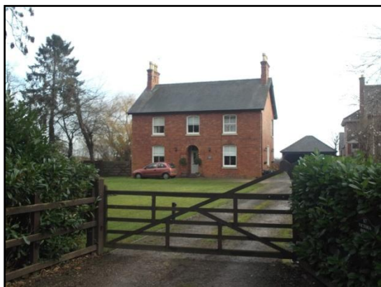
Fig. 17 No.87 Main Road, Uffington. This detached red brick and slate property, set back within fairly large gardens dates to the late 19 th century and contrasts to the more traditional cottages and stone houses found in the village core.

Casewick Lane, that dates to the 17 th century. There is a Grade II listed tomb to the south of the Parish Church with a draped urn flanked by cherubs that dates to 1799.