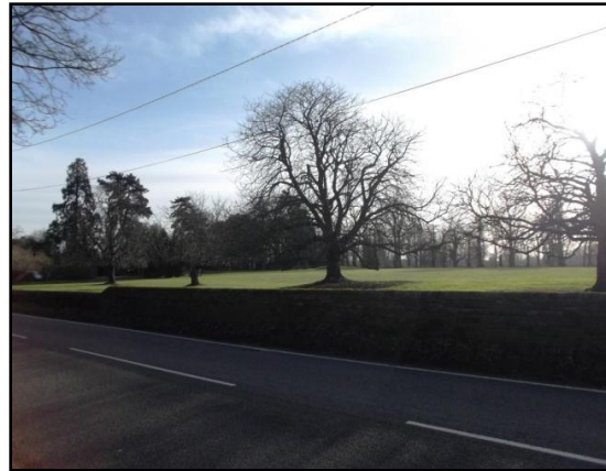
Fig.9 Trees and Parkland of Uffington House make a significant contribution to the character and appearance of the conservation area.