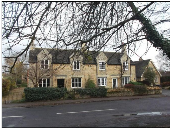
Fig. 18 Nos.79-81 Uffington Road – positive unlisted buildings. It is unfortunate that the windows to No.81 have been replaced with UPVC windows of a bulky design. However, these attractive estate cottages stand prominently behind the central village green and make a strong contribution to the quality of the village core.

To the west of the conservation area, along Main Road are a group of attractive limestone buildings that look out onto Uffington Park. This includes The Village Hall, which has a thatched roof, Yew Cottage and Nos.47-51. It is likely that Nos.49-51 are former estate cottages, and have architectural details that are found elsewhere within the village, such as the hooded moulds above the windows and doors and dormers.