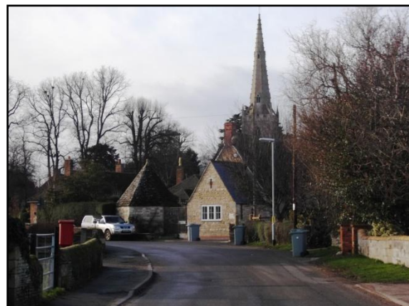
Fig. 13 View into the conservation area from the approach at Casewick Lane.

Within the historic core of the village the curving alignment of the bypass, together with grouping of the houses on Bertie Lane, the central green and mature trees contributes towards attractive views in both directions. At the southern end of Main Road, just after the coach house are immediate views in a westerly direction towards the trees and open space of Uffington Park. On the approach into the conservation area from Greatford Road, the