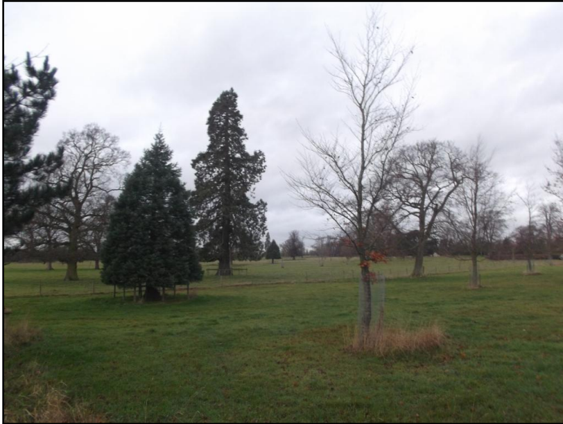
Fig.14 The trees within Uffington Park looking in a westerly direction from Main Road. The parkland is a defining feature of the conservation area.

Trees are a significant feature within the conservation area which frame key views or form the backdrop to important buildings. Many of the trees are specimen varieties, and form part of Uffington Park or have been arranged within groups at focal points in the village which are likely to have been planted by the Bertie family and include a number of Redwoods and Wellingtonia.