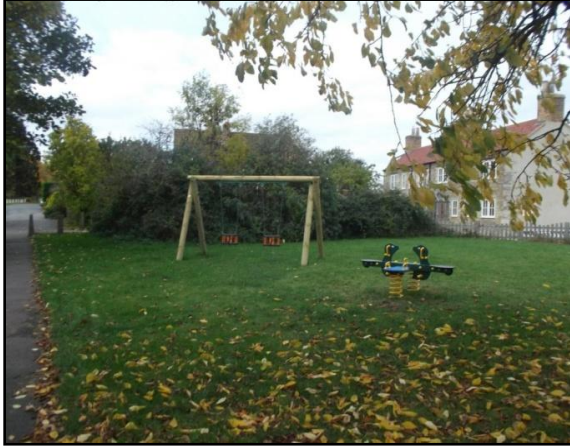
Fig.6 Open space to the north of the footpath at the end of Bertie Lane.

The ornamental drinking fountain erected for Queen Victoria's Jubilee forms a focal point in the southern view and the trees in the grounds of Uffington Park form an attractive backdrop. The north side of School Lane has a more fragmented character as it comprises two pairs of small scale brick bungalows which stand adjacent to the limestone detached school. The school features strongly, and the enclosing boundary