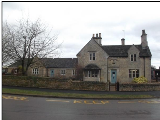
Fig.3 The Old School and School House, School Lane. Dating to 1848 constructed of limestone rubble and ashlar, with a boundary wall creating a formal sense of enclosure.

The buildings have a cohesive character and it is likely that some of them are former estate buildings, such as Nos. 49 and 51 Main Road. The presence of grass verges, the small green planted with mature trees which