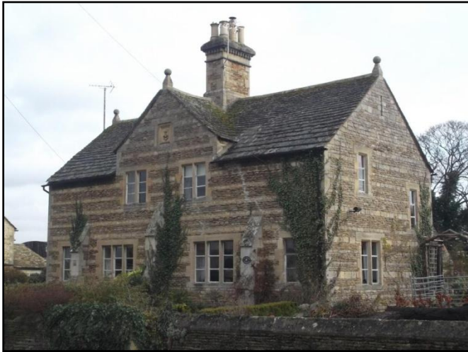
Fig.10 One of the four estate cottages on Casewick Lane with an attractive mix of coursed banded limestone rubble walling, stone mullions and gable ends topped with Ball finials. The decorative 'estate' style confers visual harmony across the