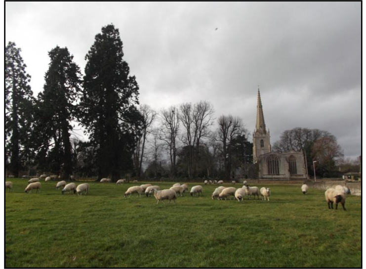
Fig.4 View across the paddock towards The Church of St. Michael and All Angels. The church is a focal point in the village.

To the west of the church, buildings are generally smaller in scale, with a greater variety of building types ranging from small terraces to semi-detached cottages which occupy smaller plots and detached farm buildings set in larger plots. Boundary walls are an important enclosing feature along the street. As Main Road progresses in the direction of Tallington, the character becomes more open with the parkland of Uffington House on the western side of the road and open fields on the eastern side of the road. The north and south lodges demarcate the end of the conservation area, and contribute towards a sense of arrival when approaching the