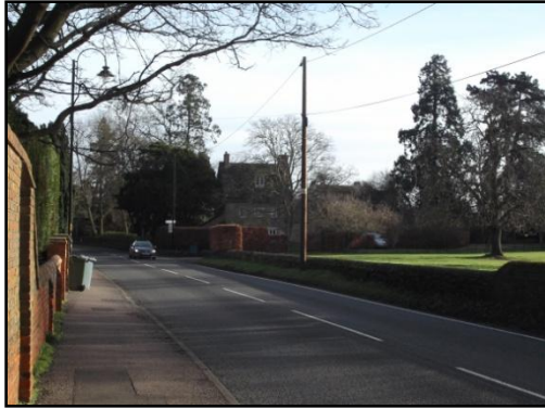
Fig.1 Main Road, with an open character with Uffington Park making a strong contribution.

The historic core of the village is characterised by a linear plan form with a low density of development. A defined building line exists along the streets as the buildings typically front onto the highways and are aligned to the rear of the narrow footways or set back within small gardens with boundary walls.