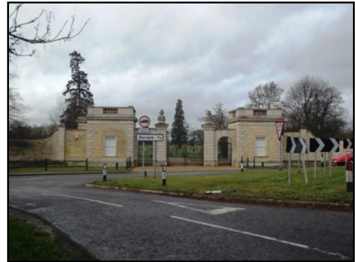
Fig.2 The North and South lodges form the focus of views upon entrance into the conservation area from the direction of Tallington from the A16. They also contribute to a formal sense of arrival into the conservation area.

St Michael's Church stands in the centre of the historic core within a small churchyard to the west of the enclosed field which contributes to the