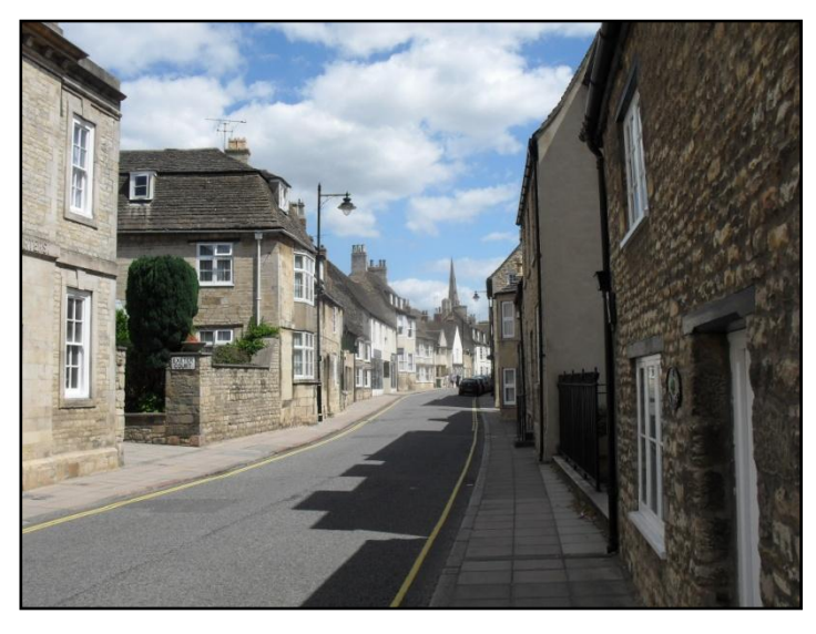
Fig. 17. Eastern view along St Peters Street.

Exeter Court, on the north side of St Peter's Street, is an early 19<sup>th</sup> century courtyard development. It was built to the rear of No. 24 and comprised of two rows of cottages across a narrow yard. The east range was modernised in the 1980s and is Grade II listed; the western range was demolished in the post war period.