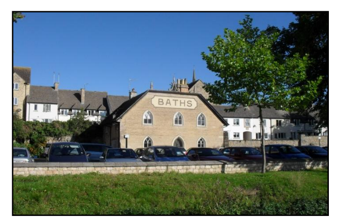
Fig. 20. The Bath House

exception of the Bath House. The rear elevations of Warrenne Keep are partially obscured by a high stone boundary wall. The Bath House dates from