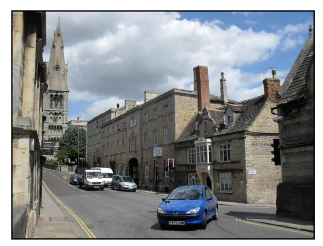
Fig. 13. East side of St Mary's Hill.

panoramic views southwards across to St Martin's with St Martin's Church prominent within the views. The return view northwards along the street is dominated by St Mary's Church. There are attractive views eastwards and