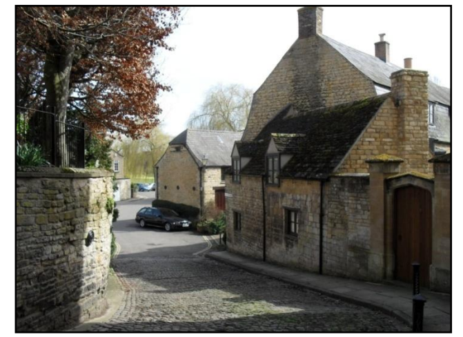
Fig. 19.Southern view along Kings Mill Lane to St Peter's Vale.

north-south from St Peter's Street to St