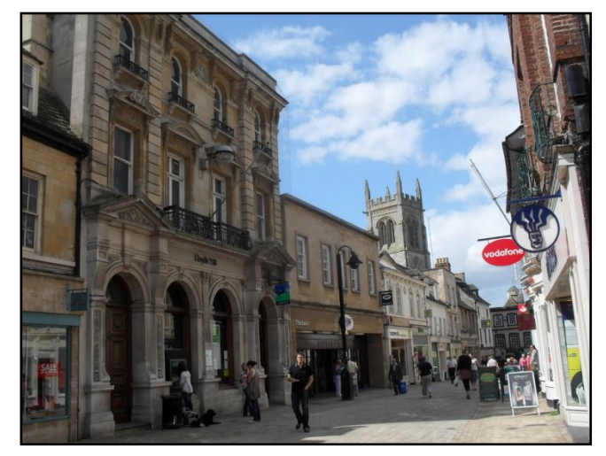
Fig. 11. Western view along High Street towards St John's Church and Red Lion Square.

occupied by Walkers Books, is an attractive timber framed