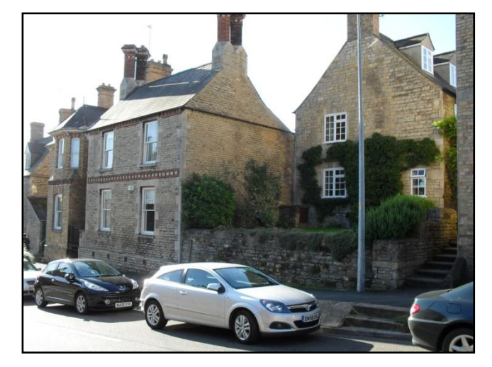
Fig. 32. Empingham Road.

The south side comprises of a group of attractive brick and stone buildings with decorative brick detailing aligned to the rear of the footway. Nos. 20-34 is a terrace of small attractive cottages set back from the footway with small front gardens, some of which have