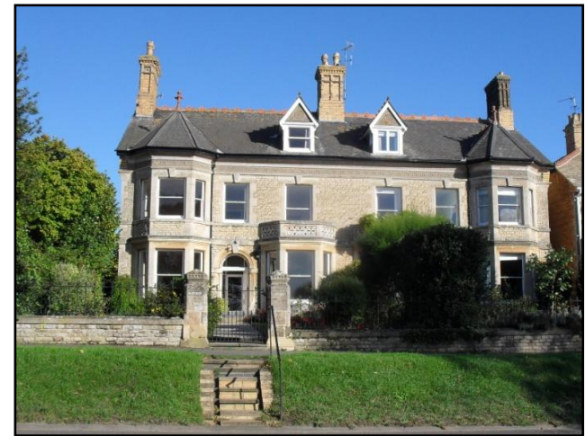
Fig. 31. Example of late Victorian houses on Tinwell Road.

Lodges at Burghley Park, the parish of St Martin's and the neighbouring village of Wothorpe which stands on the rise of the valley slope.