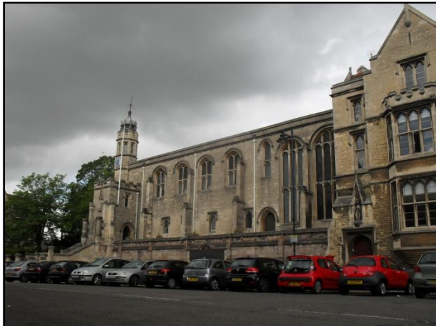
Fig. 4. Browne's Hospital, Broad Street.

in East Anglia, West Yorkshire and the West Midlands. The mid-Lent fair declined in popularity due to the impact of the Hundred Years War which imposed export restrictions and prevented the attendance of large numbers of