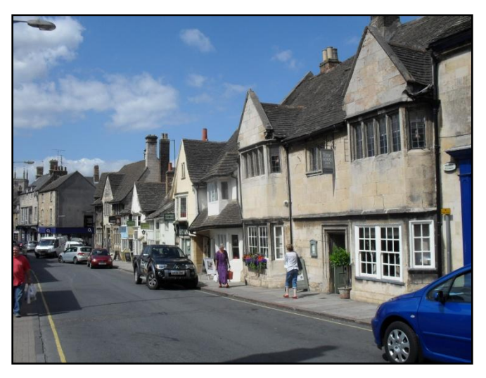
Fig. 23. Westward view along the north side of St Paul's Street.