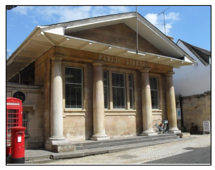
Fig. 6. The portico entrance to the shambles on High Street, converted to a library in 1906.

The town was surrounded by common land and open fields to the north, meadows to the west and the friary lands to the east which prevented expansion beyond the medieval walls prior to the Enclosure Act of 1875. Overcrowding became a serious problem as gardens and courtyards were built upon to accommodate the expanding population which had increased from 5,000 in 1801 to 11,000 by 1851. Some attempts were made to provide decent housing; Robert Newcomb, proprietor of the Stamford Mercury, built the Cornstall Buildings in 1870 for his employees. The buildings comprise of two terraces constructed at a right angle to St Leonards Street built on the site of the former St Michael of Cornstall Church. Following the Enclosure Act, the common land was developed for villas and terraced housing with provision for open spaces and playing fields and the Town Meadows were preserved as common land.