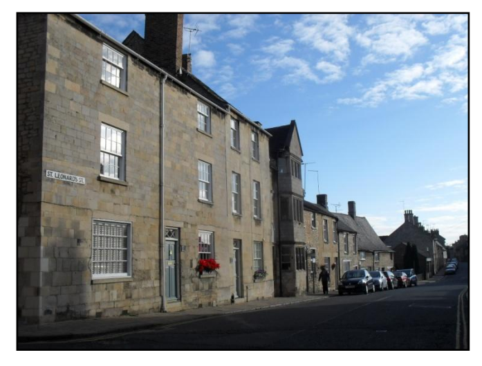
Fig. 24. Eastern view along St Leonard's Street.