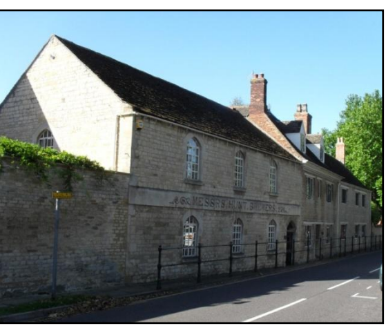
Fig. 29. Former brewery buildings on Water Street.

The south side comprises of small scale buildings, some of which are