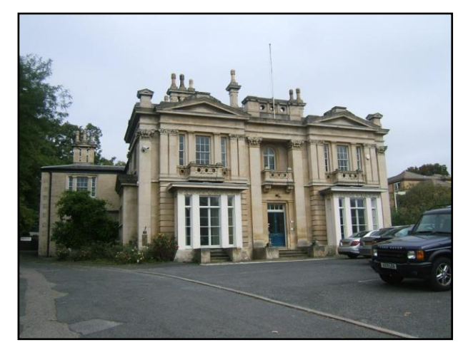
Fig. 16. Rock House and adjacent petrol station.

Victorian Italianate style villa built for Newcomb; No. 31 on the south side was originally the stables to Rock House. The Scotgate public house has an attractive decorative terracotta front by Blashfield. Truesdale