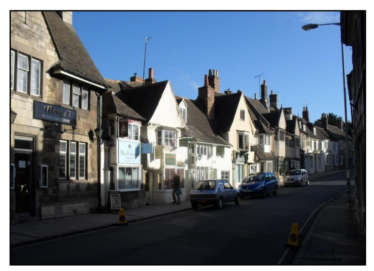
Fig. 3. Medieval buildings on the north side of St Paul's

The town's high status and prosperity attracted six religious orders which established houses on the periphery of the town centre; St Leonard's Priory, Greyfriars, Blackfriars and the Carmelites stood to the east, Austin Friars to the west and St Michael's Nunnery stood on the south bank on the periphery