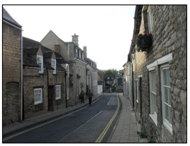
Fig. 21. Southern view along St George's Street.

the street with the trees of Burghley Park rising above the roofline. The spire of St Mary's Church can be glimpsed in the break in the building frontages on the west side.