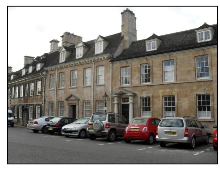
Fig.22. South side of St George's Square.