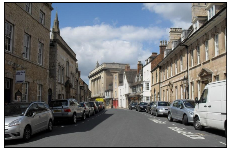
Fig. 12. Western view along St Mary's Street with the Stamford Hotel on the right.

There are several attractive examples of traditional 19<sup>th</sup> century shop fronts, including Nos. 11-12 (currently occupied by Sinclairs), 13, 14 and 31.