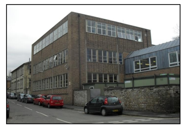
Fig. 27. Stamford School buildings on Park Lane.