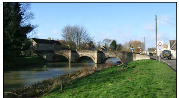
Fig.10 Deeping St. James Bridge; as well as a key structure in the conservation area it is a Grade II* listed building and a scheduled monument. It dates to 1651.

government's Statutory List of Buildings of Special Architectural or Historic Interest. These buildings are protected by law and consent is required from South Kesteven District Council before any works of alteration (to the interior or exterior), extension