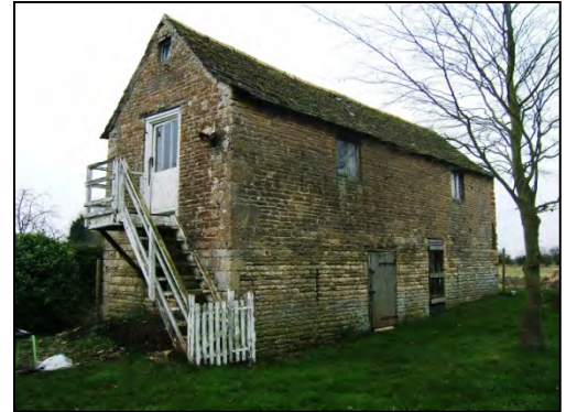
Fig.11 The boathouse is a reminder of the former history of the conservation area and its association with the River Welland. It can be seen in views from the south of the river. It is currently in a declining condition and is on The Council's internal Heritage's 'at risk' register.

There are 17 listed buildings within the boundary of the conservation area which reflects the historic and architectural quality of the village. St. James's Church which dates from the 12th century with 13th-18th century alterations, three mid 18th century table tombs and the village lockup are Grade I listed. Deeping Gate Bridge and Priory Farmhouse which is early 17th century in origin are Grade II*. An interesting example is the boathouse at the rear of No.2 Church Street, which has an access on the south gable front for admitting boats, No.30 Bridge Street a 17 th century limestone rubble building with an oriel window, which was supposedly used as a lookout for lighters travelling along the river. The listing descriptions are available online via the Heritage Gateway website ( www.heritagegateway.org.uk ).