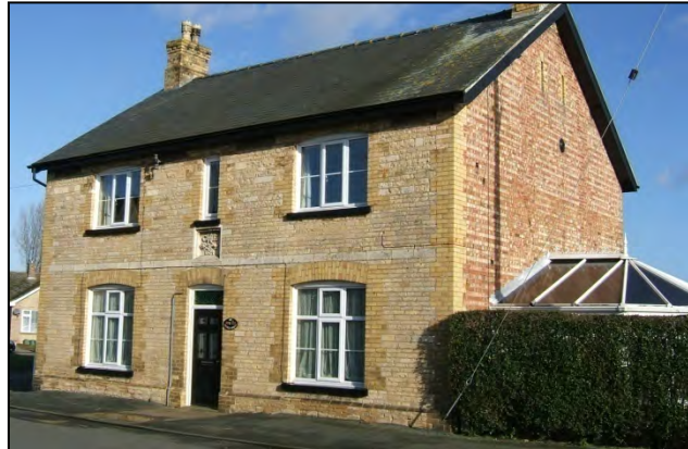
Fig.13 No.1 Church Street, a 19th century buff brick building, with pleasing symmetrical elevations makes a positive contribution to Eastgate.

Currently there are no locally listed buildings in the Deeping St. James conservation area. Buildings identified on the conservation area map as 'positive unlisted buildings' are recommended for consideration for inclusion on any future Local Heritage List.