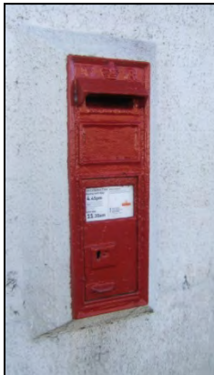
Fig.9 VR' post box within the walls of 23 Bridge Street; the building is in poor upkeep and would benefit from some repainting and maintenance works.

There is limited historic floorscape within the conservation area. There are some flagstones within the grounds of the Parish Church and an attractive early 19 th century cast iron milepost adjacent to No.40 and No.42 Church Street which is in good condition. There are a number of historic post boxes within the conservation area, including a 'VR' post box within the wall of No.23 which is in need of refurbishment with the building itself also in need of care, an ER pillar box adjacent to the footbridge on Bridge Street and 'ER' post box within the wall of the post office on Church Street. There is a cast iron fingerpost at the junction of Bridge Street and the B1162 that is in very good condition and forms part of the setting of the Bridge and there is a listed milepost outside Nos. 40 and 42 Church Street. The milepost and Nos. 40 and 42 Church Street form an attractive grouping together.