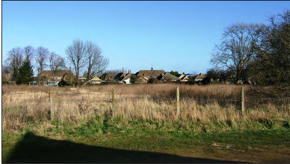
Fig.8 Important area of open space to the rear of Bridge Street