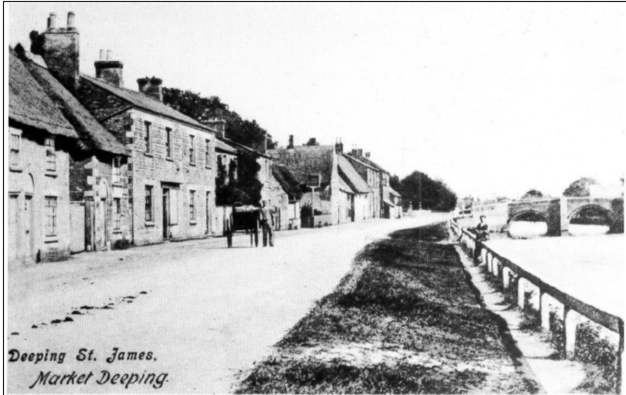
Fig.2 Photograph of Bridge Street 1910c showing a defined building line along the street with properties looking out onto the river Welland. This character largely remains intact today.

The historical development of the village is intrinsically linked to the River Welland, with the principal streets following its contours and buildings arranged in a linear fashion, tightly packed and directly addressing the street. Buildings typically were built with large plots to the rear with market gardens with the river providing an important means of communication. The river was also crucial in the transportation of materials for the building of great fen churches.