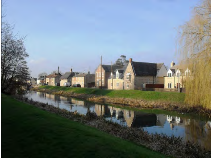
Fig.6 View looking towards the buildings that line Bridge Street from across the district boundary in Peterborough. There are interconnecting views between both districts across the river at various points in the conservation area.

Views within the conservation area are generally constrained by the building frontages. However, at Bridge Street where there is a more open character there are attractive views northwards from the south bank of the river towards Bridge Street and the return view southwards towards Deeping Gate.