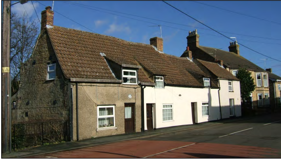
Fig.15 The use of impervious renders on traditional buildings is not in keeping with the conservation area. It is also harmful to the building fabric by preventing moisture from evaporating from the building.