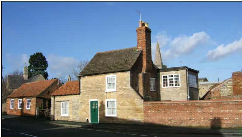
Fig.12 No.10 Church Street, a good example of a vernacular building also with a number of attractive outbuildings.

Church Street and Church Gate has an attractive mix of stone and brick and also has a number of small outbuildings within the site; it retains many of its original features such as two by two sash windows. The Scout Headquarters, which was a former school stands gable end on and has some attractive details such as stone mullions.