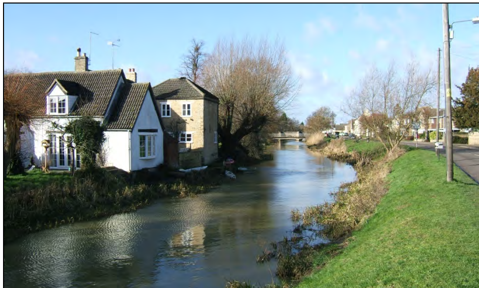
Fig.1 River Welland with Deeping Gate to the left and Bridge Street to the right – the conservation area has a meandering character that follows the contours of the river.