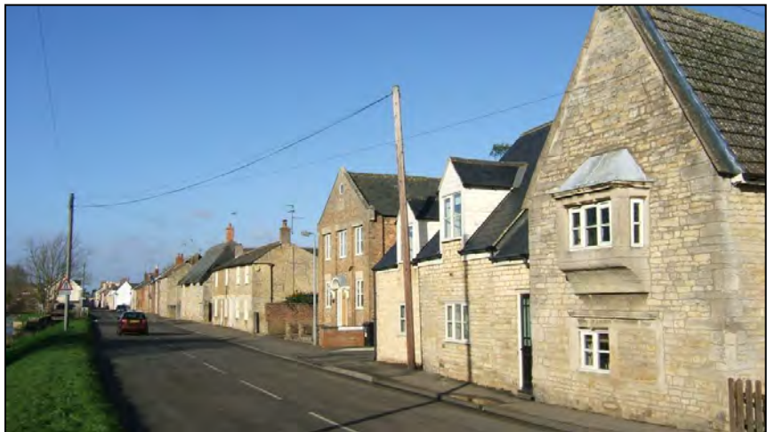
Fig.4 Bridge Street, showing the predominate architectural styles of the conservation area and broad similarity of material palette.

Bridge Street has a harmonious character derived from the material palette which is predominantly limestone interspersed with brick. The colour tones of limestone and brick are broadly similar which partially integrates the traditional and post war buildings in spite of the differences in architectural styles and alignments along the street.