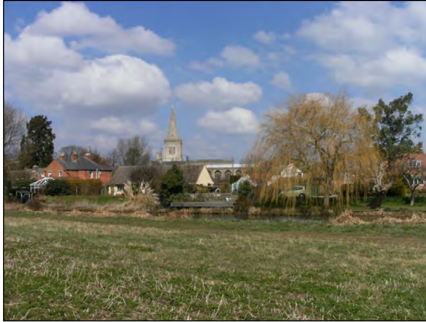
Fig.7 View looking towards the conservation area from the southern riverside from within the boundary of Peterborough City Council.