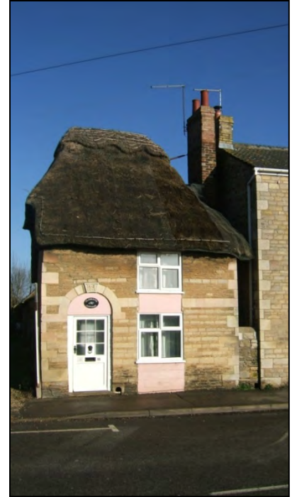
Fig.14 16 Bridge Street, the use of UPVC significantly harms the appearance of this thatched cottage.