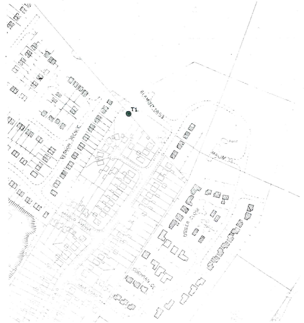
SITE PLAN 1/2500 SCALE