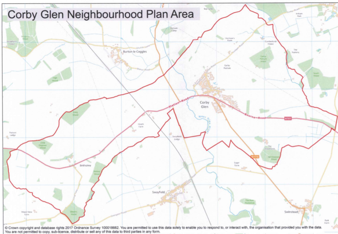
Fig. 1 Boundary of Corby Glen Parish/Designated Neighbourhood Plan Area

The Parish Council then sought to engage local residents in the process and a Steering Group was established. In the interest of openness, breadth, independence and getting people with a range of skills and interests involved, the group included other local residents, who were not Parish Councillors. The group organised an extensive community survey in August /September 2019. Following interruption related to Covid 19, the Steering Group was re-formed in 2021 and there was a formal consultation on a full Draft Plan in Spring 2022.