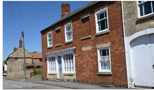
Examples of houses along The High Street (from Market Square)

The High Street runs north towards the junction with Tanner's Lane and Irnham Rd. Some stretches are narrow and enclosed with houses built close to the road, and other stretches (particularly at its northern end) are more open. The continuity of the street is interrupted by 20 th century developments (for example Barleycroft), and there are modern infills and barn conversions behind the traditional buildings lining the street. The west side of the high street has mainly small-scale buildings, typically arranged in small terraces or pairs of semidetached cottages. The houses on the east side are larger with generous rear gardens and are typically detached or semi-detached.