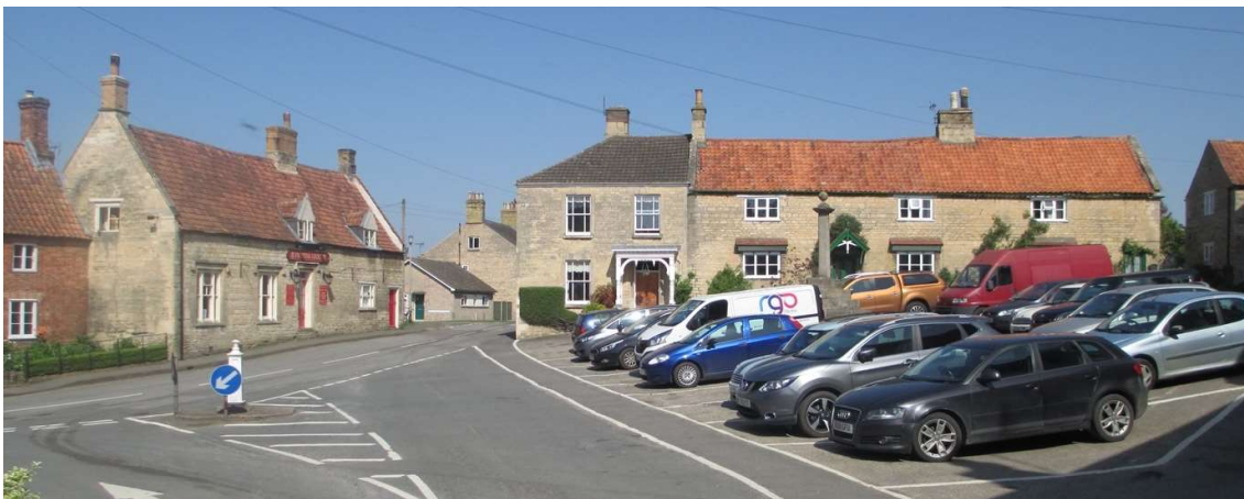
Corby Glen Market Square and The Fighting Cocks pub.

It is a substantial open space, situated on a slope facing to the south west, and is enclosed on four sides by large traditional buildings. A 14th century market cross, together with a 19th century water pump adds to its attractive traditional character. The Market Place comprises a mixture of residential properties and commercial establishments: The Fighting Cocks (a public house), The March Hare (tea rooms, cafe and bed and breakfast) and Lily's Lavender Hut (general store and café). The Market Place is also used as a central car park.