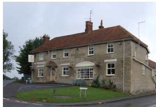
The Woodhouse Arms pub.

Further up towards the A151, on the east side, is located the impressive Willoughby Gallery (the original Charles Read grammar school), which faces the gable end of New Row terrace (late Victorian) and the open space of the Green. At the crossroads where Morley Lane joins the A151, on its west side, there is the entrance to Laxton's Lane, which provides a tranquil pedestrian route down to Station Road. Opposite this end of Morley's, on the south side of the A151, there is The Woodhouse Arms, an attractive and prominent 18 th century building.