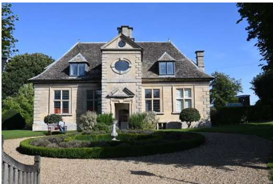
The Willoughby Gallery.

Church Street continues into Moreley's Lane, which leads up an incline to crossroads on the A151, where the Lane continues as Swinstead Road. Moreley's Lane is mainly bordered by verges and hedges, broken by the frontage of several detached modern-day dwellings, and the rear entrance of properties with their front entrances in the Market Place or Church Street. The farmyard on the junction with Church Street adds to the rural character of the Lane.