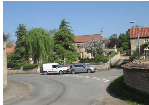
The Church Street Rooms and houses on Church Street

Church Street continues into Moreley's Lane, which leads up an incline to crossroads on the A151, where the Lane continues as Swinstead Road. Moreley's Lane is mainly bordered by verges and hedges, broken by the frontage of several detached modern-day dwellings, and the rear entrance of properties with their front entrances in the Market Place or Church Street. The farmyard on the junction with Church Street adds to the rural character of the Lane.