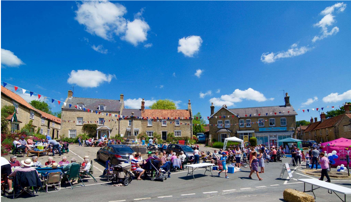
Corby Glen Market Square is often used for community events

The main feature of the historic centre is the Market Place which forms a valuable hub to the village and has probably been used for community celebrations in Corby for over 900 years.