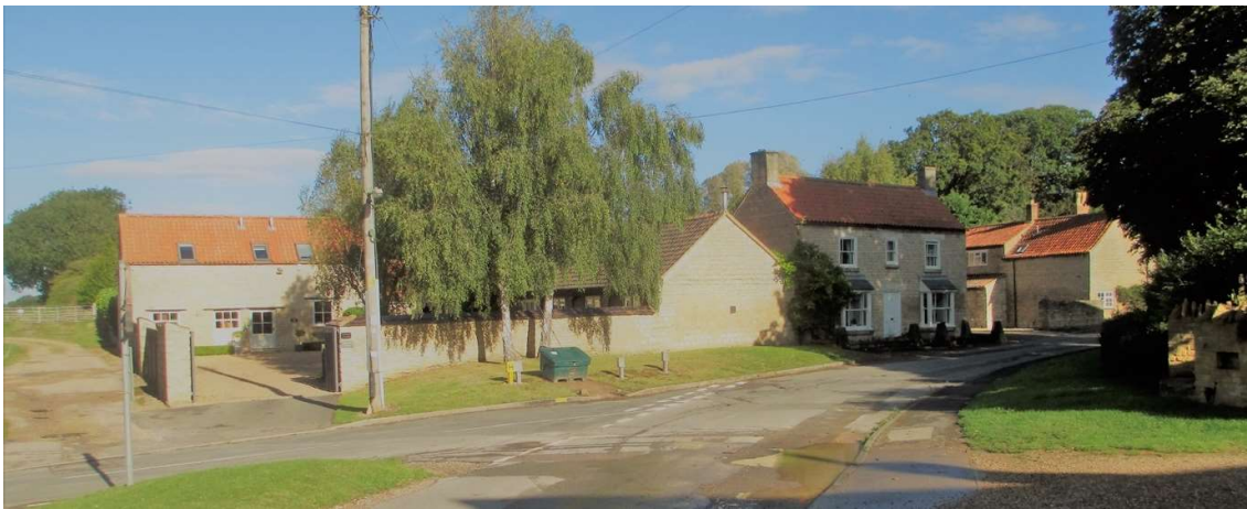
Junction of Tanners lane, Irnham Road and the western end of the High Street

The Nisa grocery store (formerly Co-op) is located in a traditional building on the east side of the High Street some 50 metres from its junction with Coronation Road. The narrowness of the street at this point, with difficult parking, creates congestion at busy times. Further along the east side, just beyond the Coronation Road junction, lie the former Catholic school, Presbytery and Catholic Church, all private houses. These significant listed buildings lie well back, with large front gardens enclosed by boundary walls.