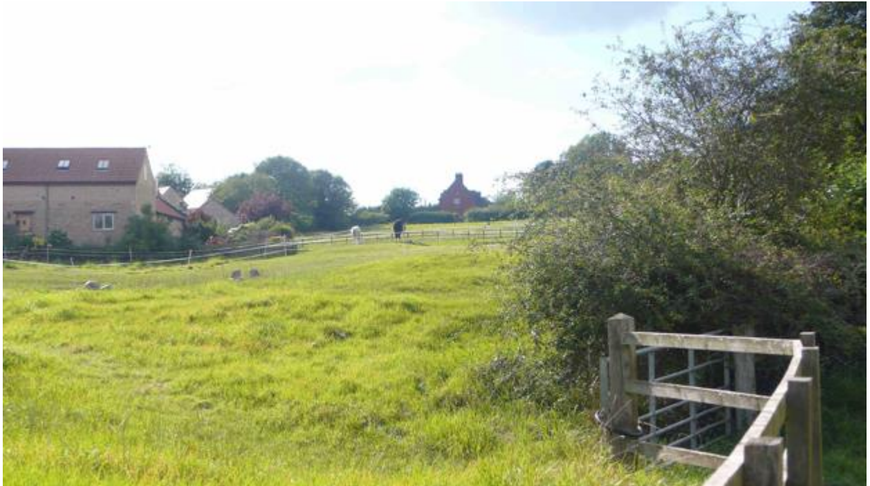
7. View across the paddock, an important area of open space, from Church St.