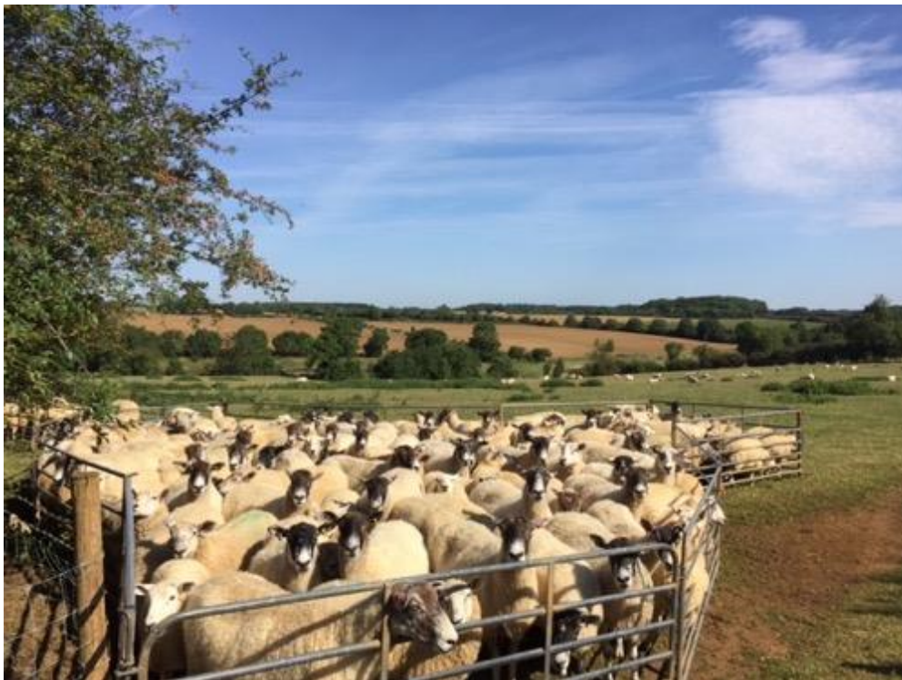
16. View from Colsterworth Rd looking north across fields from the edge of the Conservation Area.