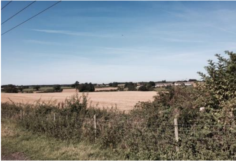
17. View from Colsterworth Rd looking west towards the village at the entrance to the Conservation Area.