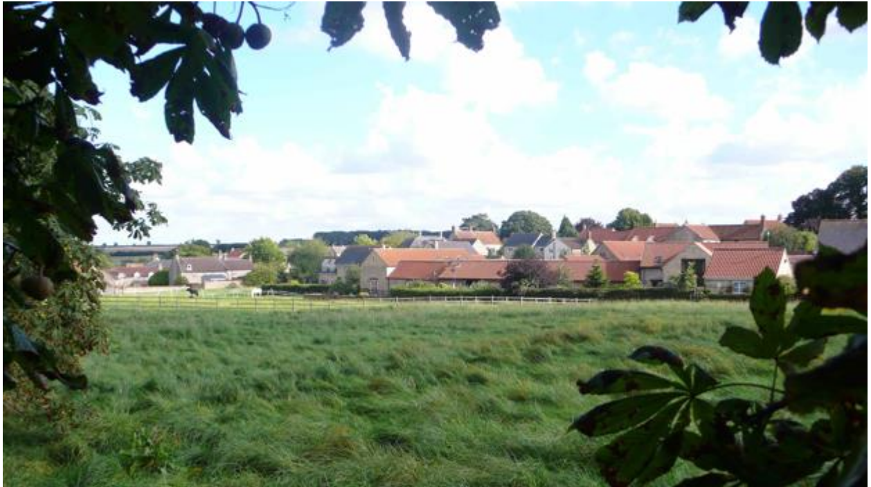
9. View from the east of the village green across the paddock.