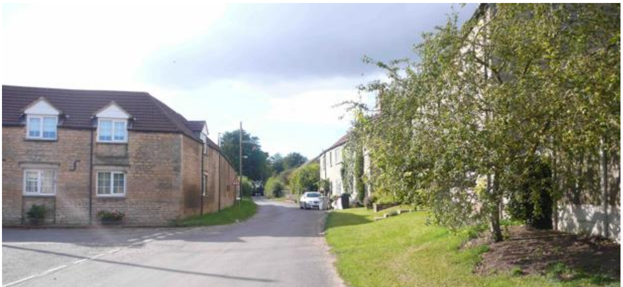
6. Enclosed views to the east and west of Church St.