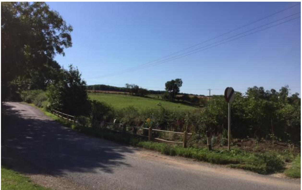
5. View from the valley bottom at Cringle Brook towards open fields to the south.