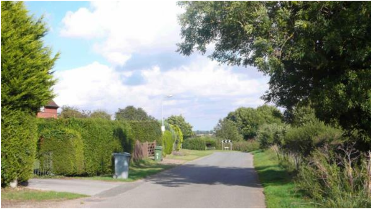
15. View from the Conservation area boundary at Sproxtan Rd towards the village green.