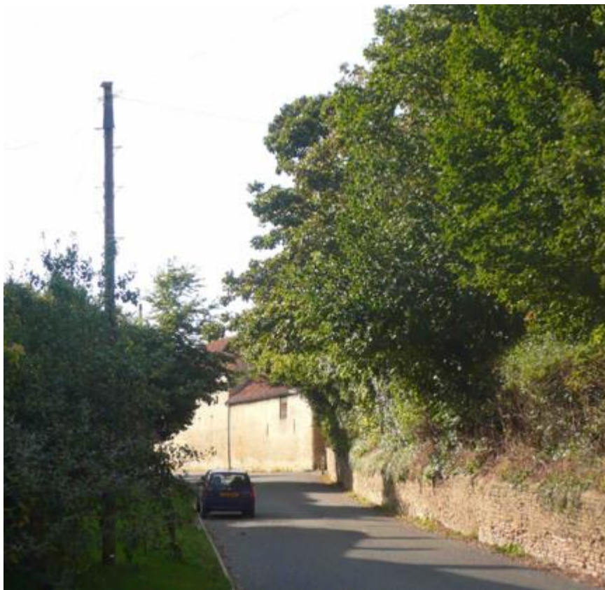
3. Enclosed views to the east and west along Colsterworth Rd.