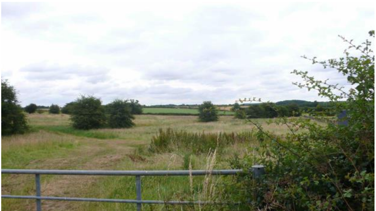
10. View from the track at Park Lane towards the open countryside with the distant tree belts of the Stoke Rochford estate in view.