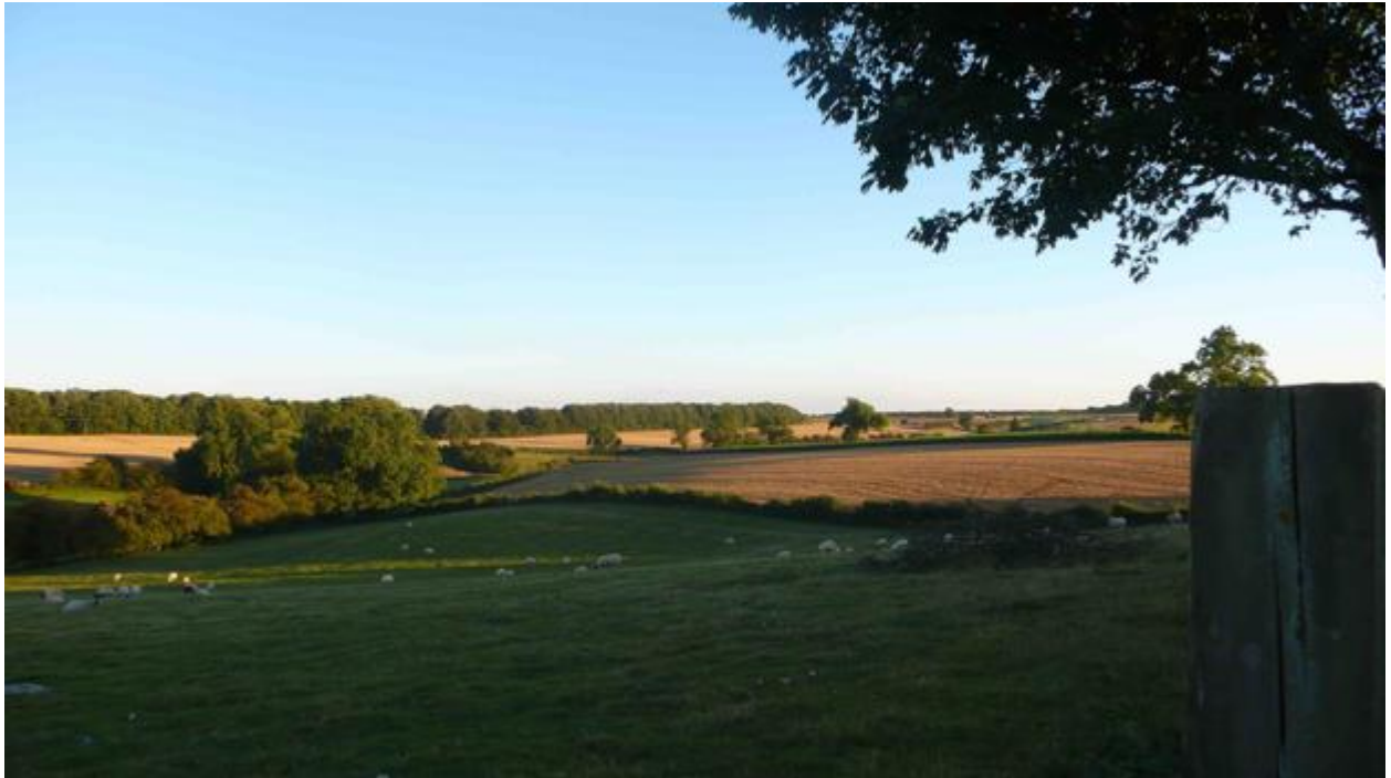
4. View towards surrounding open countryside from the track at the rear of Stonepit Lane.