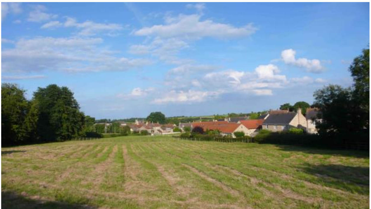
8. View across the paddock from the Green.