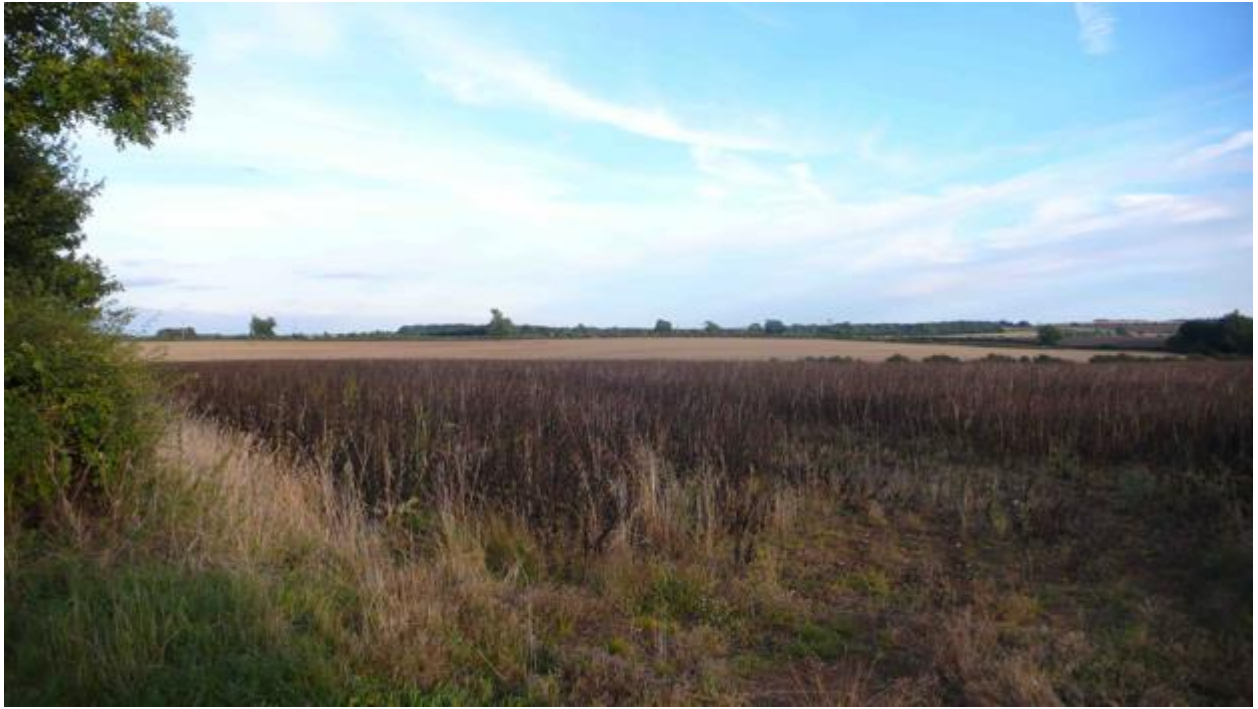
11. View from Sproxton Rd towards open countryside to the south.