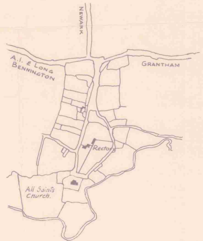
SITE PLAN 6" TO 1 MILE (SK. 84)